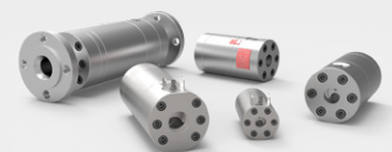
KEM Helical Flow Meters (SRZ Series)